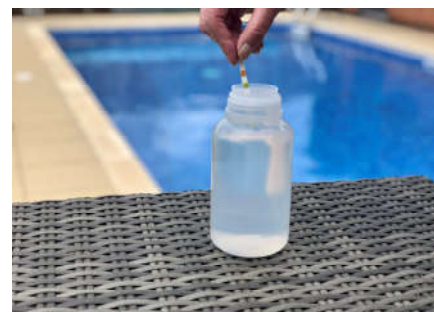
Testing using test strips or offsite testing using supplied screw cap