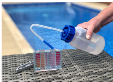
Testing using supplied screw cap spout adaptor and liquid or tablet reagents