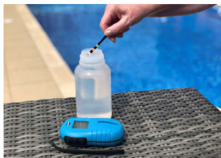
Testing using a digital test strip reader

This low cost unit is suitable for commercial and domestic use